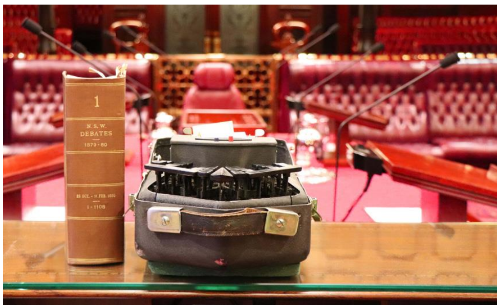
Parliamentary Education produces its own images for social media and program promotion. This image was used to promote an evening lecture on 22 October celebrating 140 years of Hansard at the NSW Parliament.