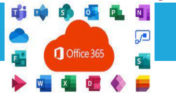
E-Forms & Signatures