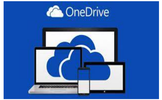
ICT Gadgets Issue