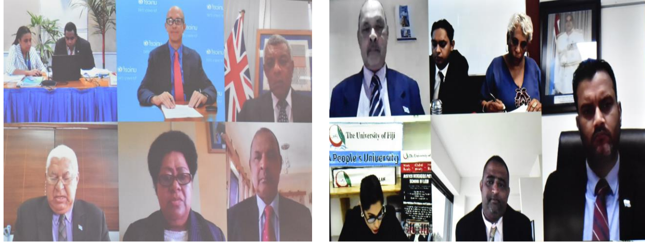
Committee Meetings and Hearings (Local and Overseas)